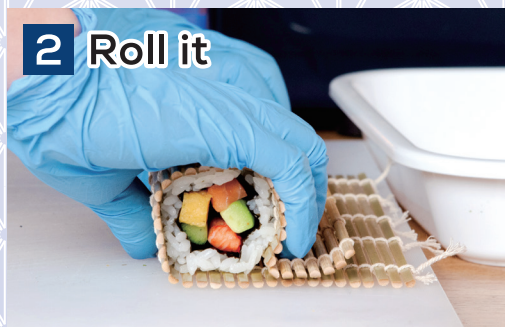
2 Roll it