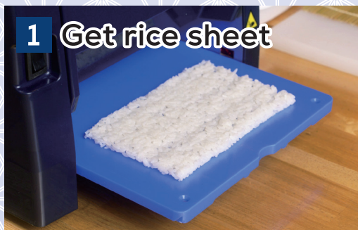
1 Get rice sheet